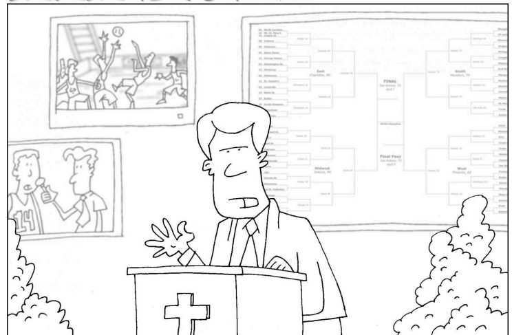
THE SERMON TITLED "MARCH MADNESS HERE TODAY, NOW IN HD" WAS A HUGE HIT